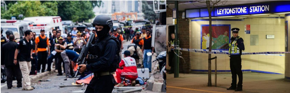
Terror in Jakarta

As well as these incidents, there are ongoing terror attacks in Egypt, Israel, Turkey, West Africa, and the Far East, perpetrated by a mixture of Daesh groups, and individuals, as well as those claiming allegiance to other extremist groups within the Sunni, Shia, and other movements.