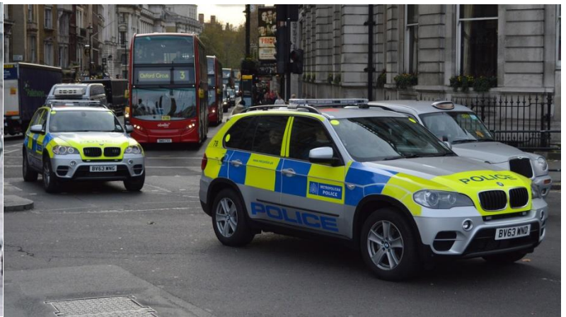
Met Police Armed Response Vehicles